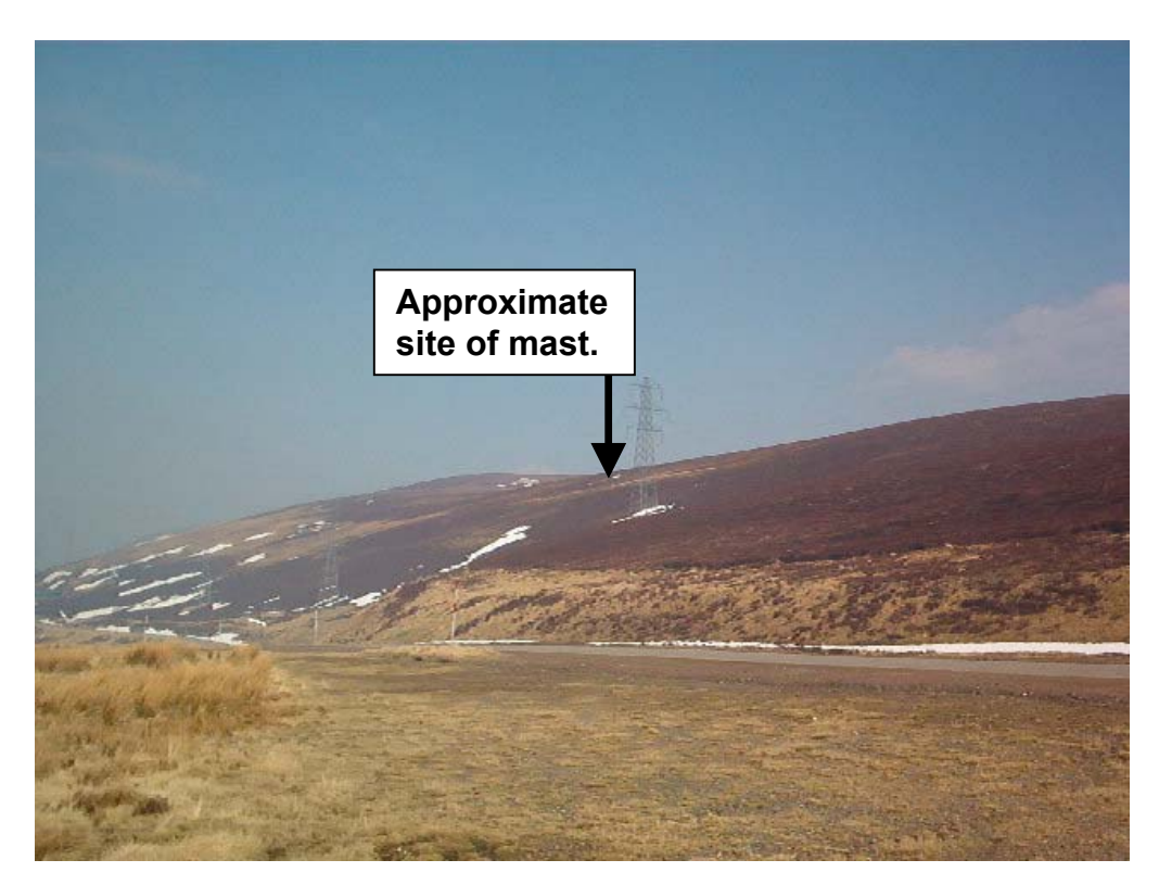
Fig. 2. Looking north towards site from the A939

3. The mast is of standard lightweight component construction, which can be transported in sections without the need for heavy vehicles. It is 152mm in diameter. No concrete base construction is required, only a steel removable base plate and the mast is secured by a series of 5mm guy wires anchored into the ground. The mast will be fitted with wind monitoring equipment in order to assess wind speeds at the locality to provide information in relation to the potential siting of a wind turbine.