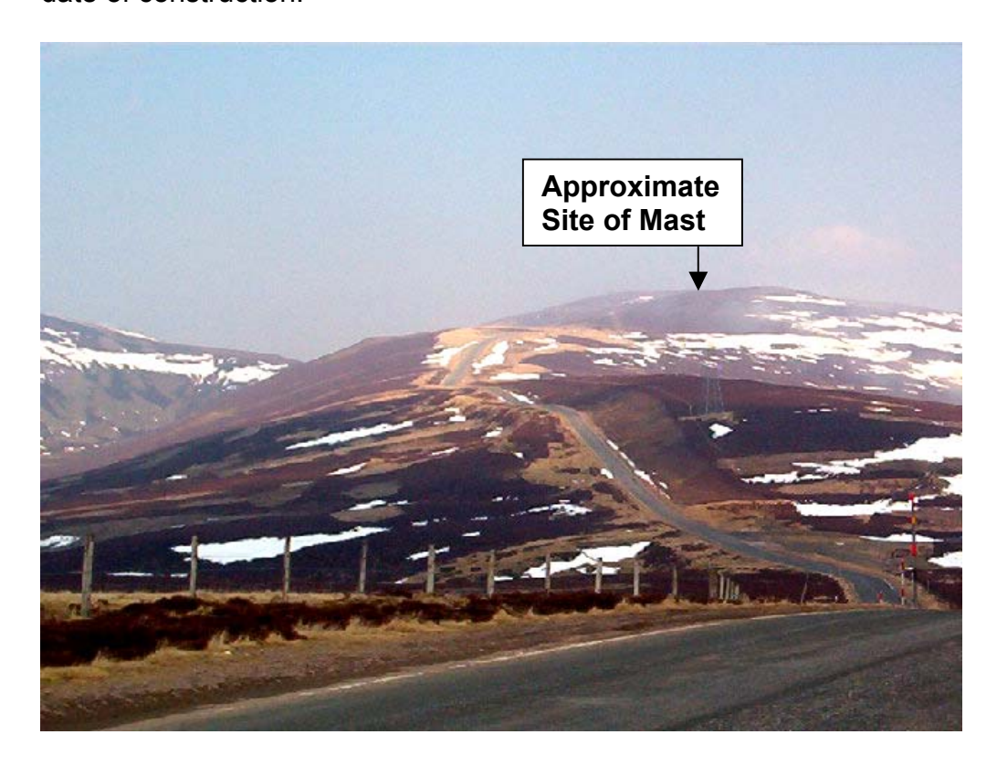
Fig. 3. Looking north towards the site from the A939 (Corgarff side)

Permission is sought for a temporary period of 12 months, from the date of construction.